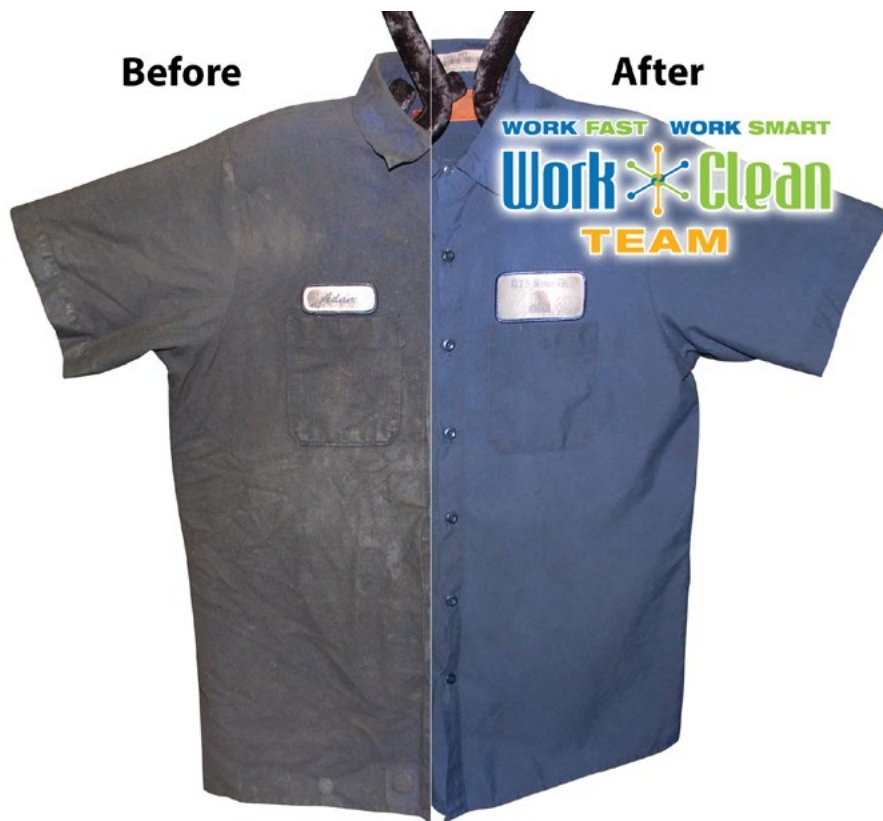
Gurtler's Work•Clean Team of products deep cleans even the worst example of greasy, oily soils

Innovation is part of the fabric of Gurtler's business model. Innovations have driven our success over the years. Our Vis-Tex Tunnel Water/Energy Saver System introduced nearly 20 years ago, revolutionized the way tunnel washers water reuse systems operated, reducing water usage per pound of textiles to under 0.5 gallons, and have become the standard in the industry. Our recently introduced Mint D-3 is designed to be the fastest acting EPA registered hard-surface sanitizer/disinfectant in the marketplace, sanitizing or disinfecting in 3 minutes or under, depending on the bacteria or virus, versus traditional products that require 10 minutes contact time. And our new surfactant technology used in our Work-Clean Team product line allows for superior quality while eliminating harsh alkaline builders, reducing wash temperature and eliminating the need for multiple rinse steps.